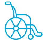
Disability Support Services