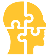
Mental Health Services