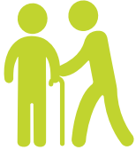
Aged Care Services