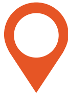
Aboriginal Community Controlled Health Organisation Services