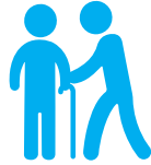
Aged Care Services