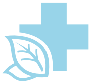
Community Health Service