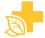
Community Health Service