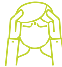
Drug & Alcohol Services