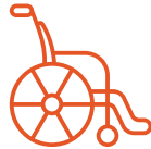
Disability Support Services