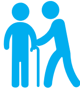
Aged Care Services