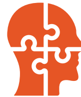
Mental Health Services