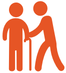
Aged Care Services