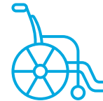
Disability Support Services