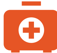
General Practice Outreach Services