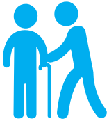
Aged Care Services