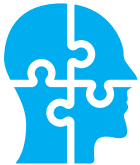
Mental Health Services