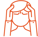
Drug & Alcohol Services