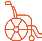
Disability Support Services