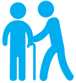
Aged Care Services