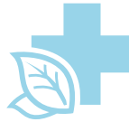
Community Health Service