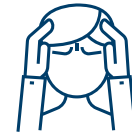
Drug & Alcohol Services