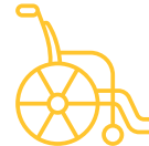
Disability Support Services