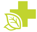
Community Health Service