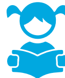
Social Work Services