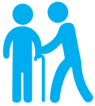
Aged Care Services