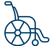
Disability Support Services