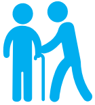
Aged Care Services