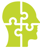
Mental Health Services