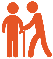
Aged Care Services